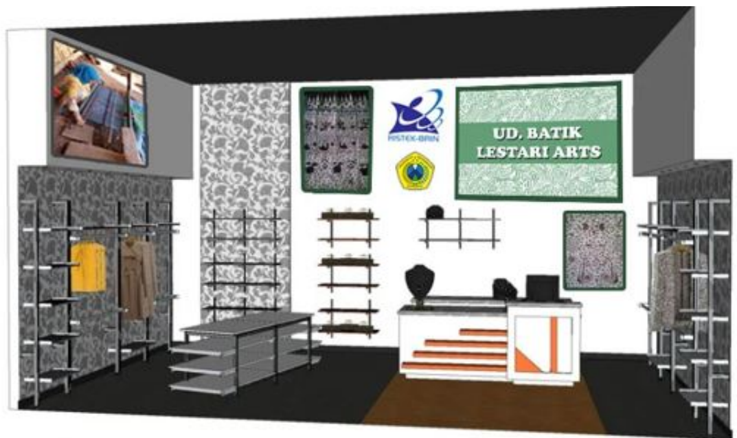
Figure 2. The design of the exhibition space