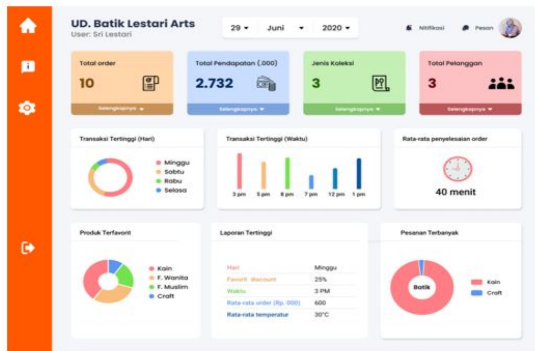
Figure 4. The dashboard application

In the dashboard application some data processing results are displayed to be the information needed by the owner of UD Batik "Lestari Arts". The information displayed includes the recapitulation of total orders, total income, type of collection, total customers, highest transaction (based on day or time), average length of service to customers, favorite products by type, and the products with the highest order at the specified time period. With this application, the owner can monitor developments. It can also be a device that helps in making decisions.